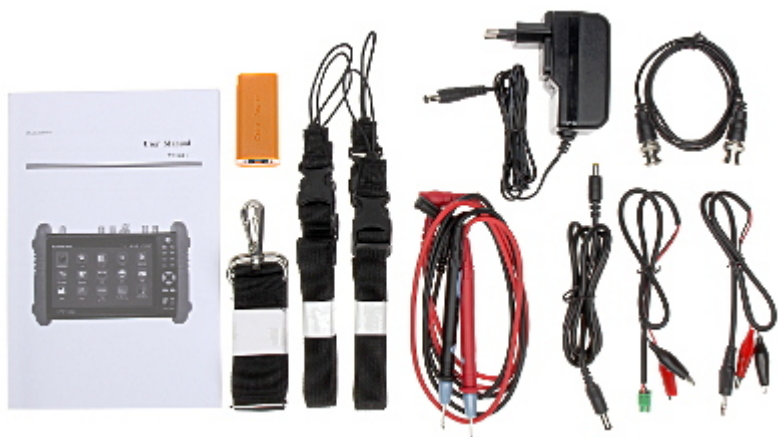
The tester with accessories housed in a handy bag: