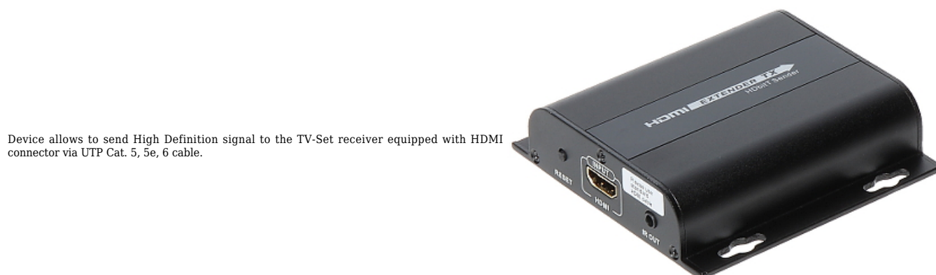
Device allows to send High Definition signal to the TV-Set receiver equipped with HDMI connector via UTP Cat. 5, 5e, 6 cable.

To return a worn-out product, use a collection and disposal system of this type of equipment or contact a seller from whom it was purchased. He will then be recycled in an environmentally-friendly way.