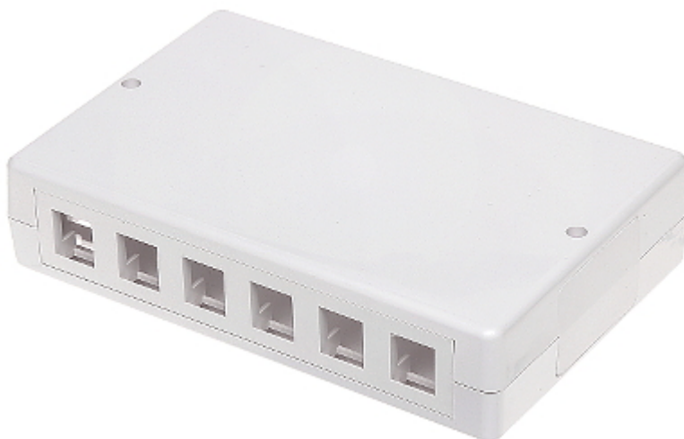
Mount box for KEYSTONE connectors.

The device must be secured against contact with caustic, staining and viscous fluids.