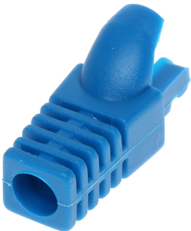
Example of application: