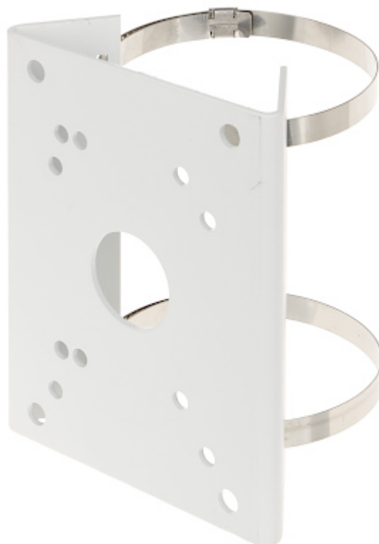
Mount designed to camera installation on a pole.

The device must be secured against contact with caustic, staining and viscous fluids.