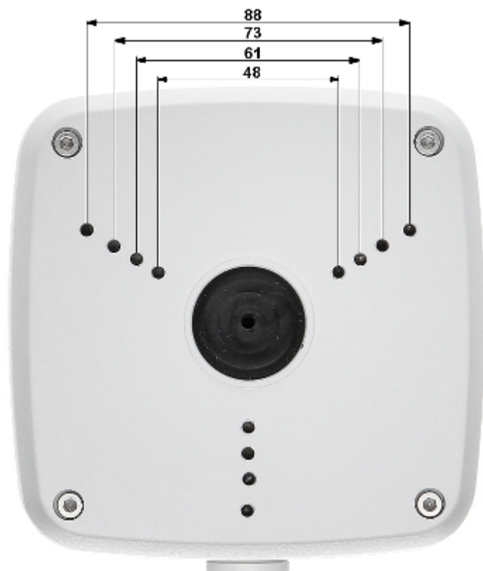
View of the ceiling mounting side: