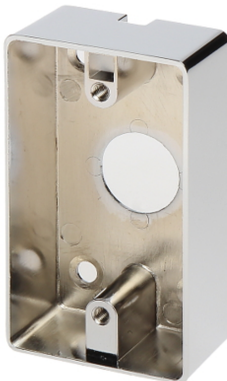
Surface box designed for ATLO-PA-1 buttons.

The device must be secured against contact with caustic, staining and viscous fluids.