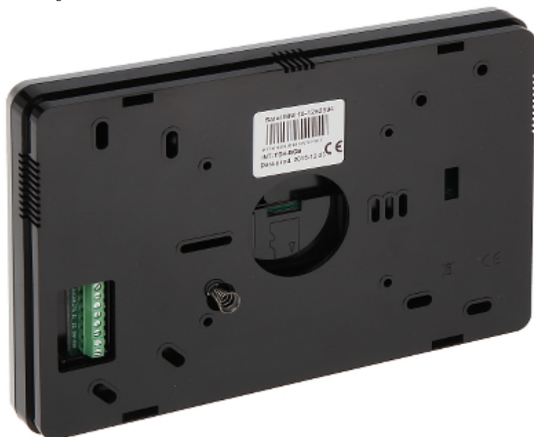
Memory card slot: