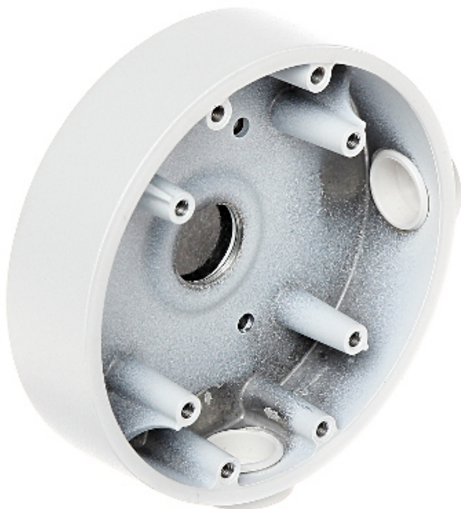
Wall mounting side view: