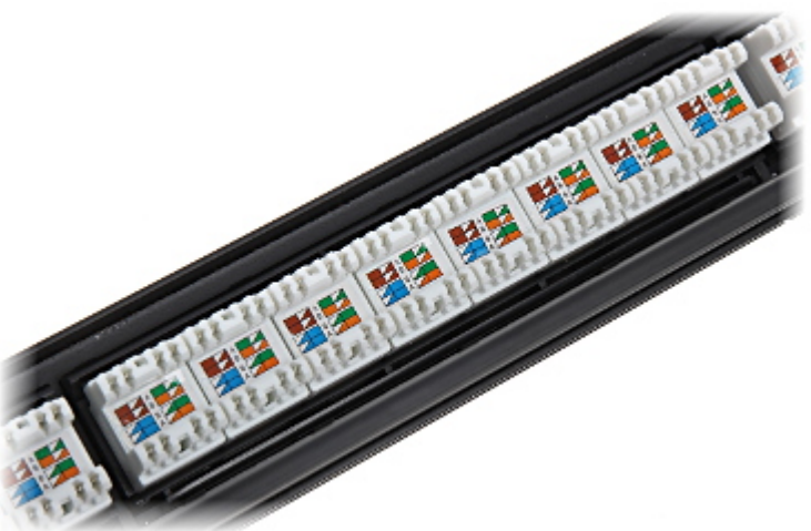
Example of application: