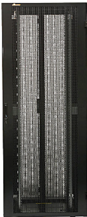
The cabinet with rear door open: