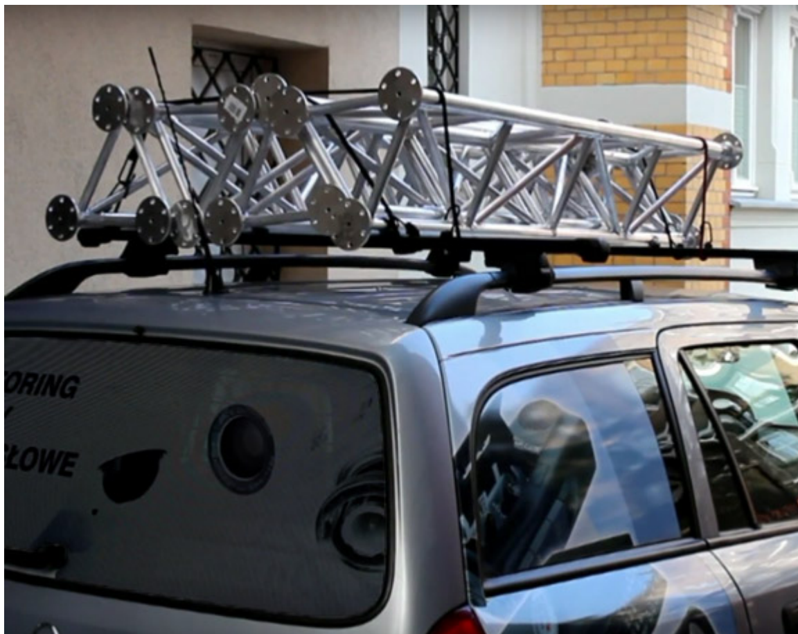
Single section of the mast: