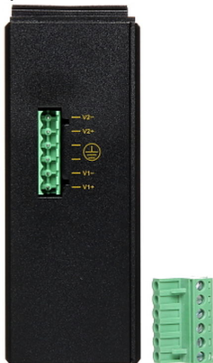
Rear panel (DIN rail installation):