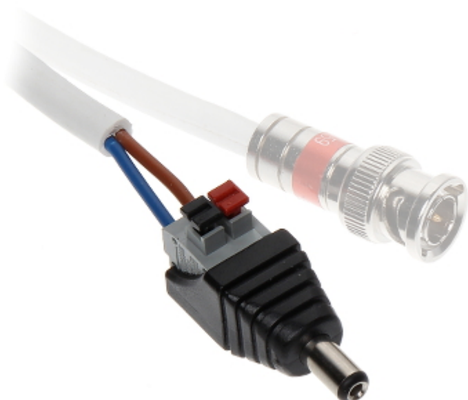
Camera connection example: