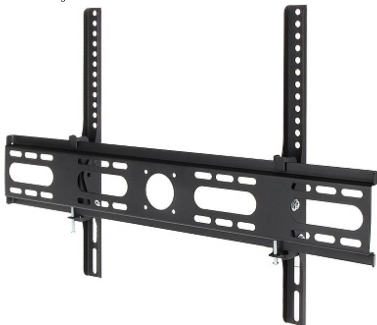
Wall mounting side view