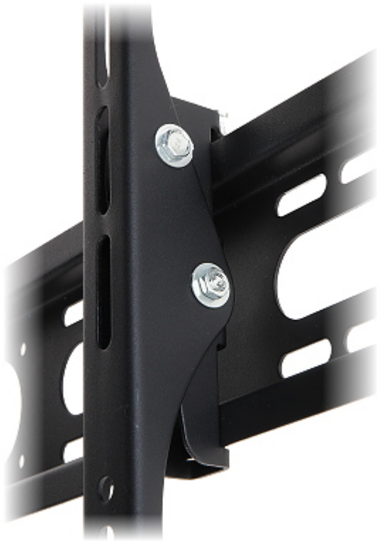
Possibility of mount adjustment