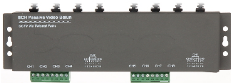
Example application for CVBS/PAL cameras: