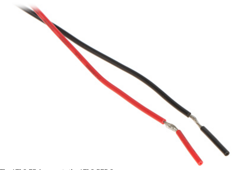
The ATLO-EB-1 supports the ATLO-BEB-3: