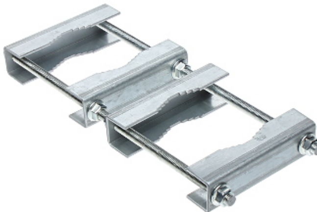
Clamp to mount two masts parallel to each other.

The device must be secured against contact with caustic, staining and viscous fluids.