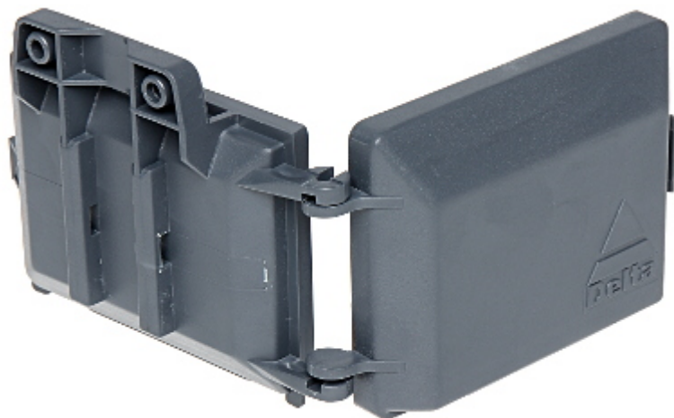
Method of mounting