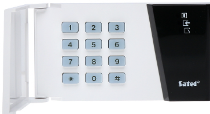
View with closed cover: