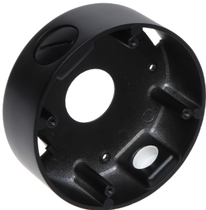
Bracket with mounted camera: