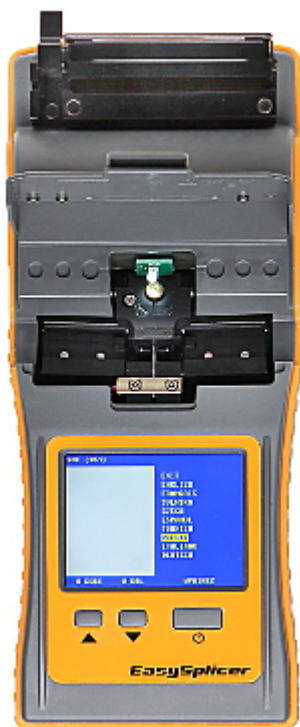
Operation elements of the splicer: