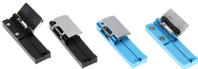
Fiber cleaver tool: