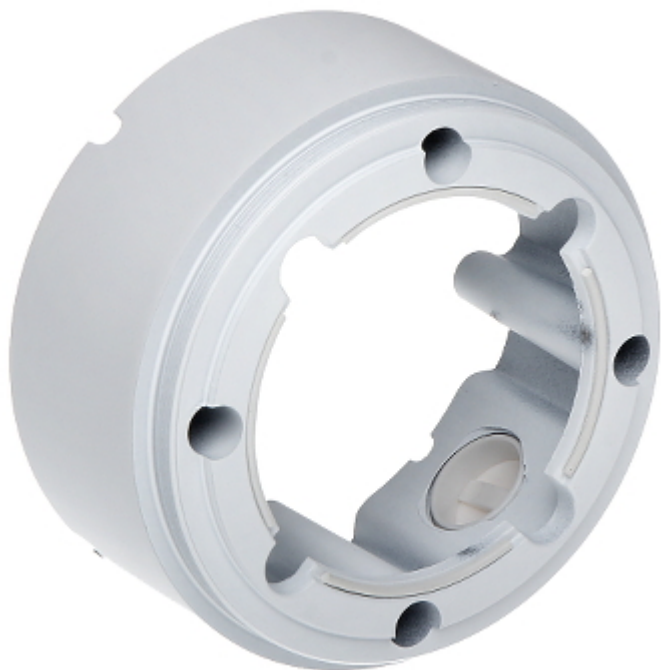
Bracket with mounted camera: