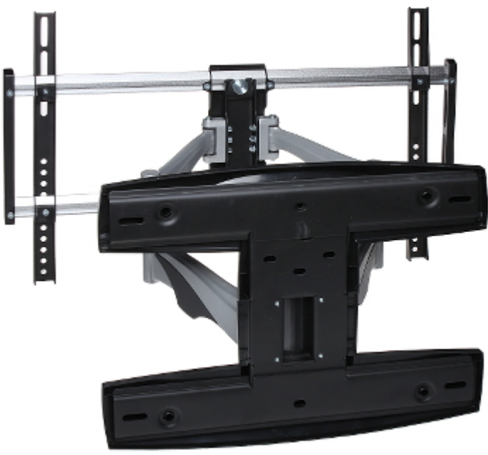
Possibility of mount adjustment: