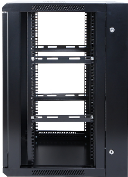
Cabinet with door open: