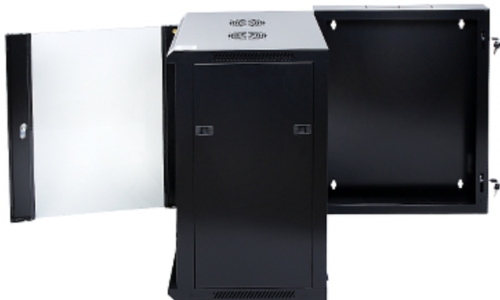
The cabinet with rear door open: