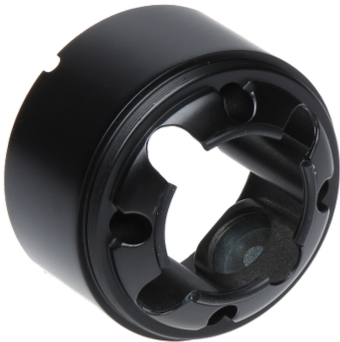
Bracket with mounted camera: