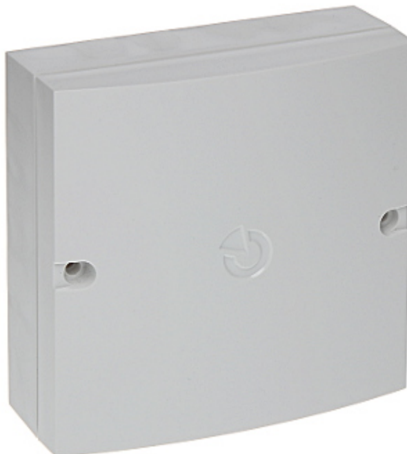
Plastic installation box.

The device must be secured against contact with caustic, staining and viscous fluids.