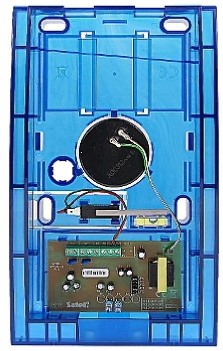
Description of particular elements of the device:

Code: SP-4001-BL OUTDOOR SIREN SP-4001-BL SATEL