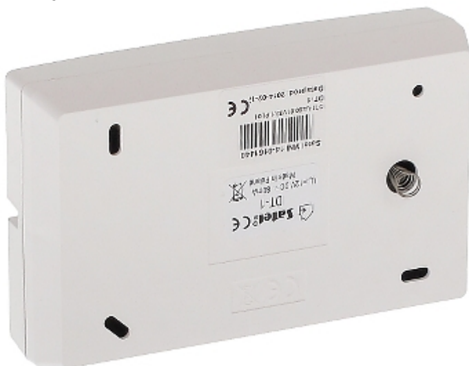
In the kit: