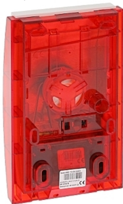
Description of particular elements of the device: