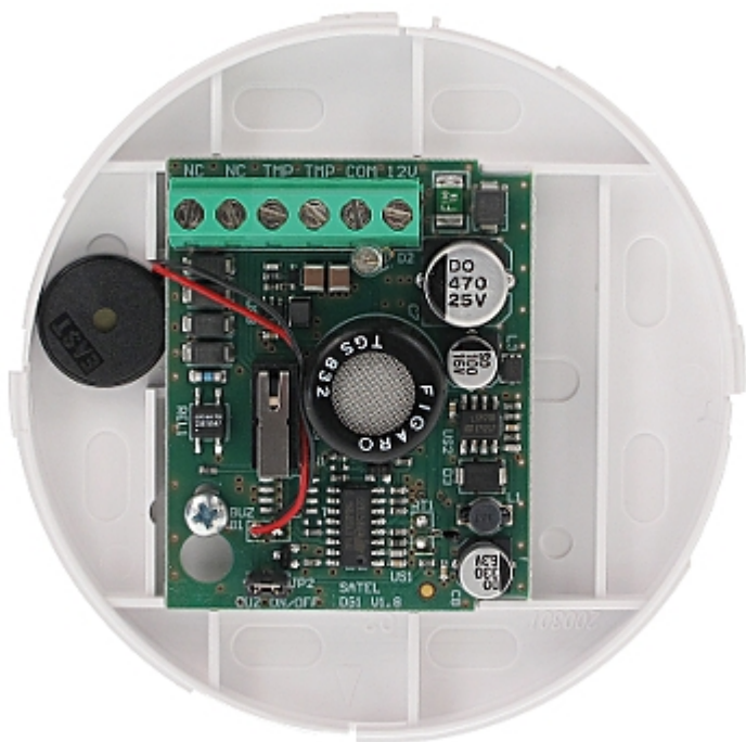
Rear view + additional kit elements: