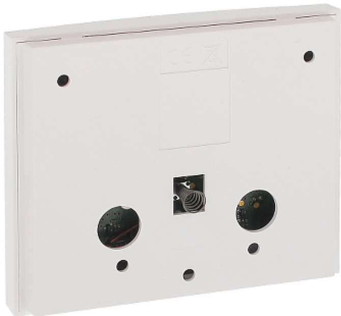
Fig. 1. Keypad CA-5-BLUE-S