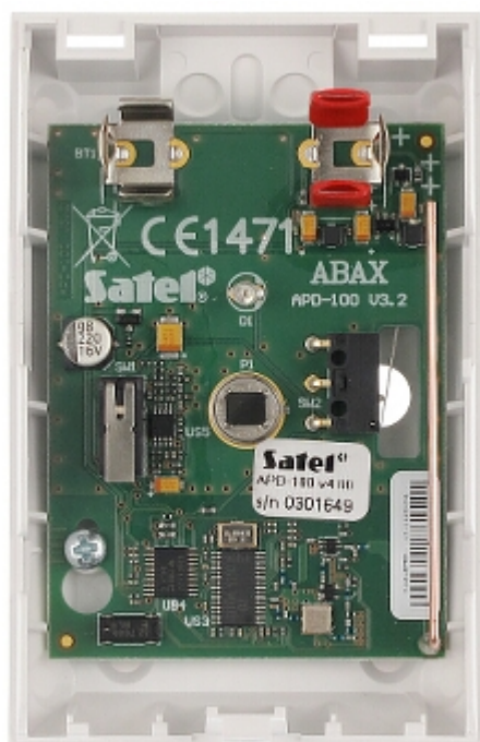
Mounting side view + additional elements included in the kit: