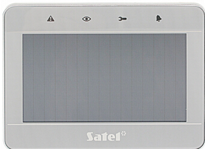
View after remove the cover: