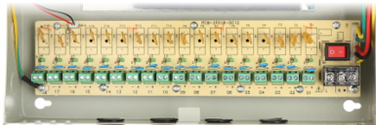
Power adapter view in lockable casing: