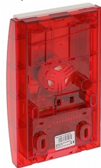
Description of particular elements of the device: