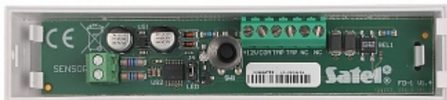
Rear view + additional kit elements: