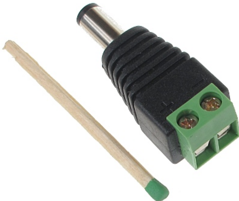
Example of use with YAP-2x0.5/100 cable: