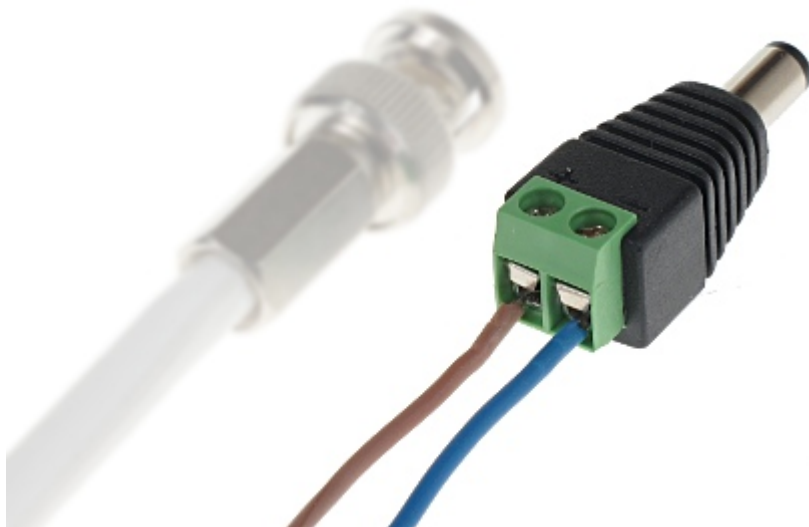
Example of use with YAP-2x0.5/100 cable: