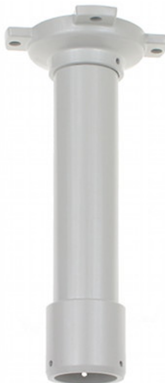
Ceiling bracket for cameras.

The device must be secured against contact with caustic, staining and viscous fluids.