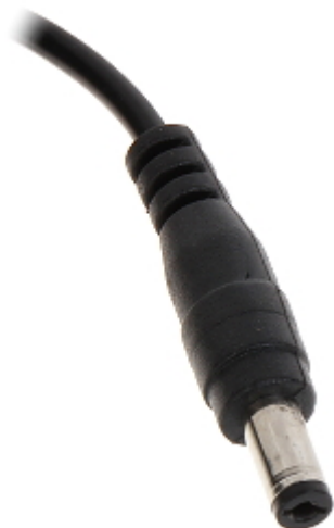
2.1/5.5mm plug polarization: