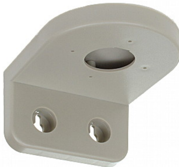
Wall bracket. Designed to dome cameras.

The device must be secured against contact with caustic, staining and viscous fluids.