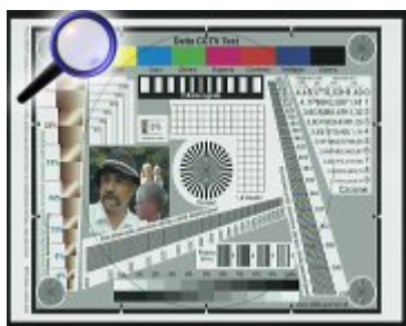
For VGA 1024x768 resolution