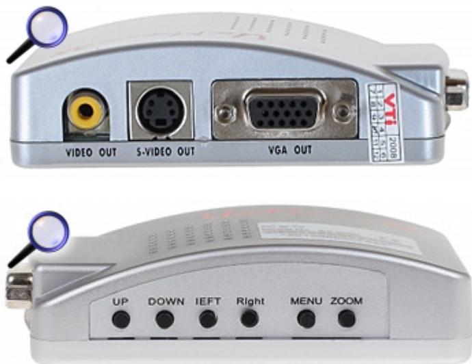
Front and rear view: