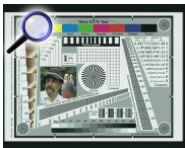
For VGA 1280x1024 resolution