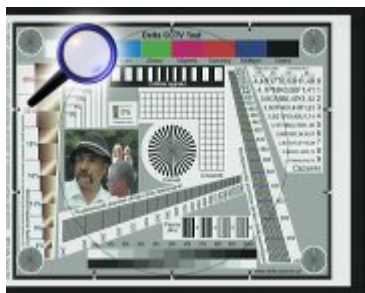
For VGA 800x600 resolution