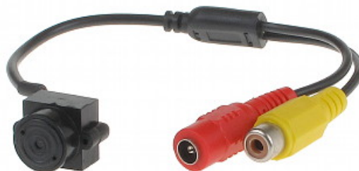
Black/White micro camera. The one of the smallest cameras available in our offer. Camera is equipped with PINHOLE type lens, needs only a very small hole to get right field of view.

To return a worn-out product, use a collection and disposal system of this type of equipment or contact a seller from whom it was purchased. He will then be recycled in an environmentally-friendly way.