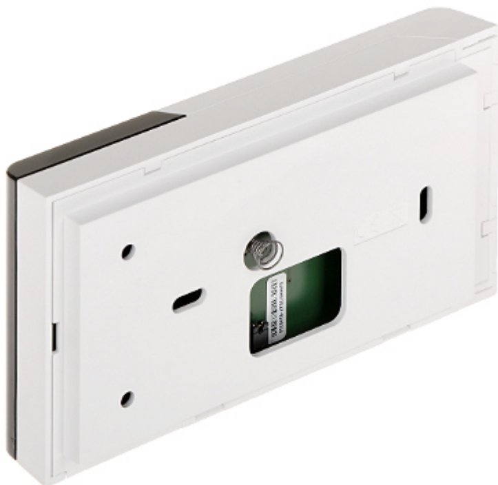
Internal view (after open the enclosure):