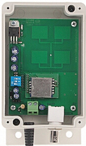
Internal view of the receiver: