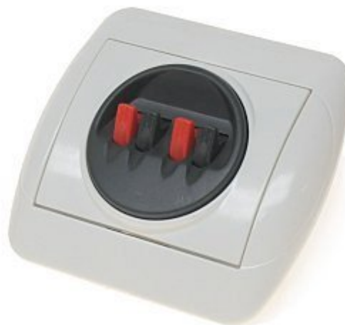
Surface outlet with connector. 2X HI-FI.

The device must be secured against contact with caustic, staining and viscous fluids.