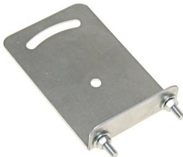
Bracket to ATK-P1/2.4-3M antennas with angle adjustment.

The device must be secured against contact with caustic, staining and viscous fluids.