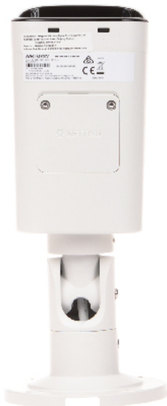
Memory card slot and "Reset" button: