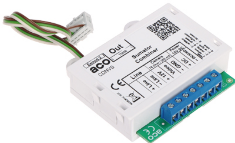
Combiner starting the digital video system bus.

The device must be secured against contact with caustic, staining and viscous fluids.