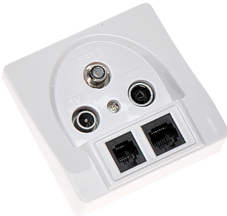
Outlet combines the functions of radio-tv-satellite socket and a socket for telephone and Internet connection.

The device must be secured against contact with caustic, staining and viscous fluids.